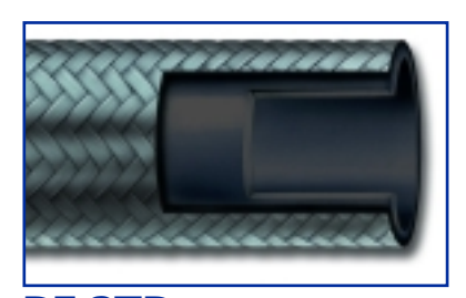
RF-ST Smooth Bore PTFE or Black Conductive PTFE Lined Hose with Braided Stainless Steel Cover